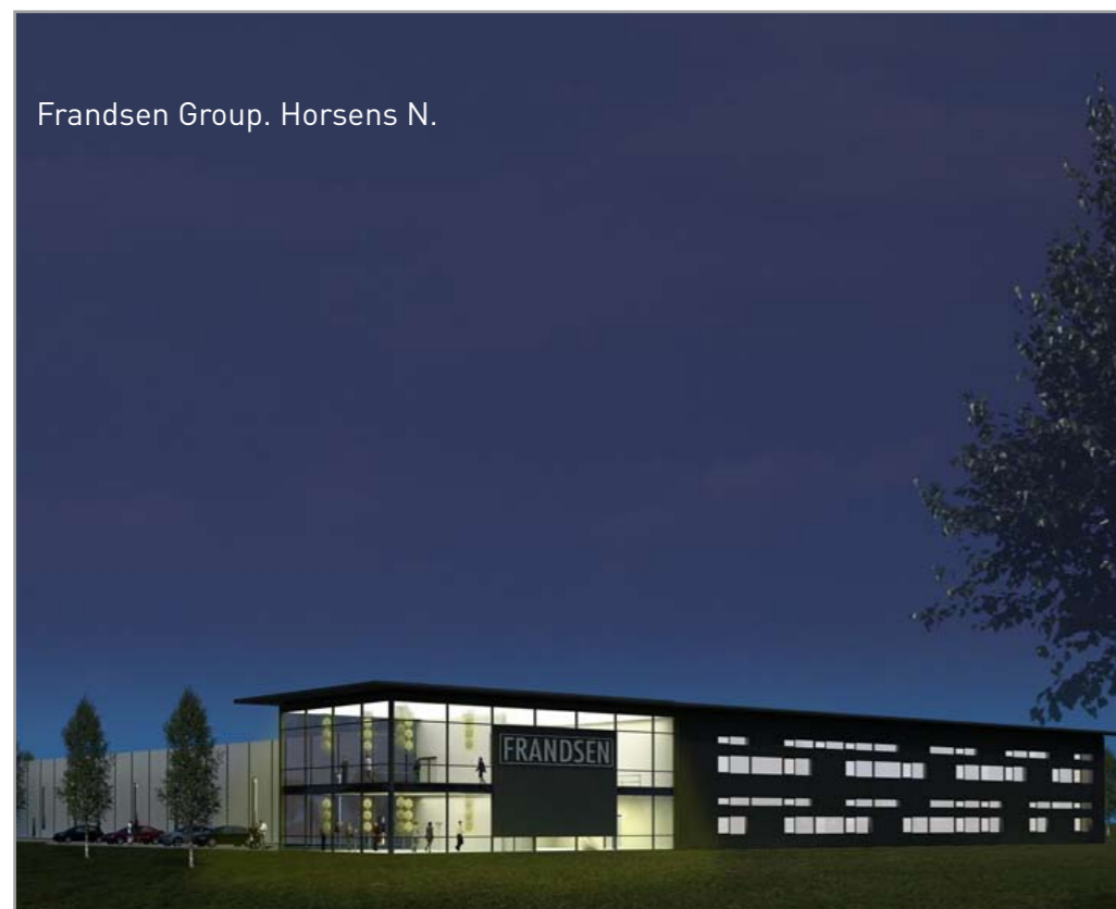
Frandsen Group. Horsens N.

The approx. 6,000 square metres of buildings will house the entire Frandsen Group (Frandsen Lighting, Frandsen Projekt and Verpan).